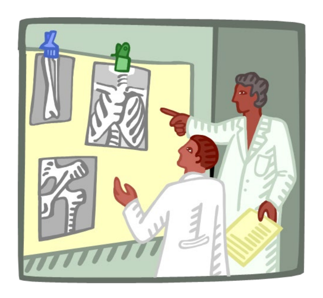
Section Two: Radiography Program Policies